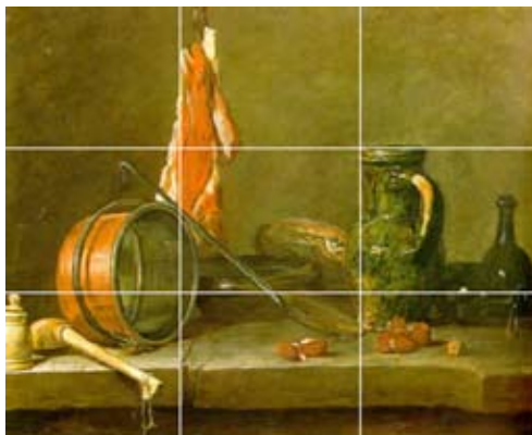
Rule of Thirds example. A Lean Diet by Chardin

5. Do not draw objects. Instead, follow the contour line that weaves throughout the painting to get a stronger composition.