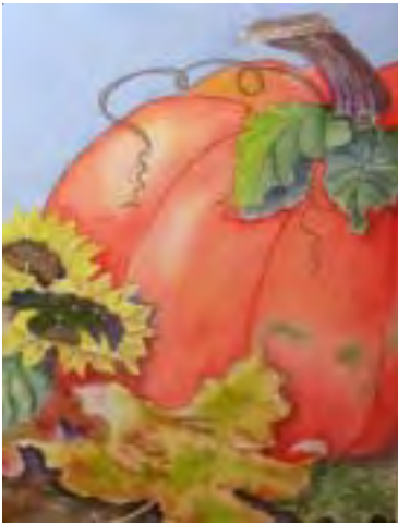
Signs of Fall by Elizabeth Collard

Students went away pleased and happy with a completed painting for their efforts.