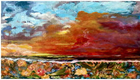
"Sunset" - Larry Kamlot