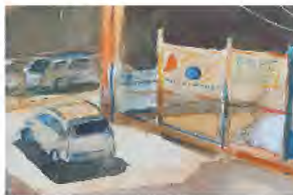
"Night Parking" - Angela Herbert-Hodges

Those who participated were entered into a drawing for a Dick Blick gift card. Congratulations to Phyllis Zwarych our lucky winner..