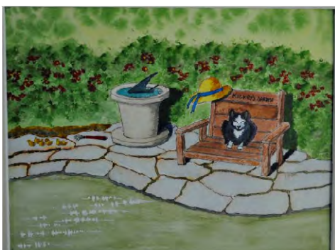
"Mickey's Garden" - Phyllis Zwarych