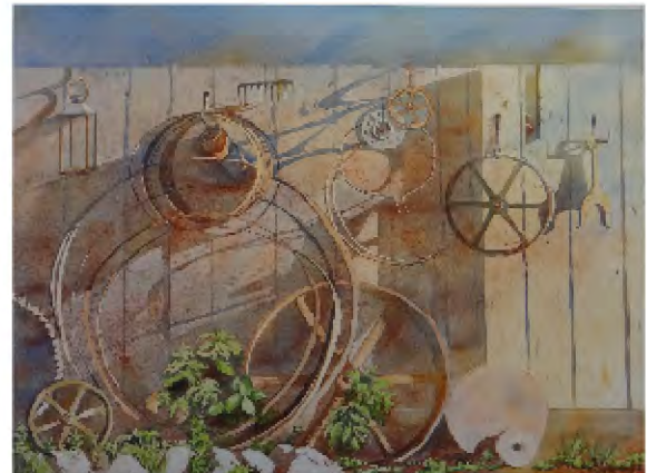
"The Blacksmith's Fence" Second Place Award Isabel Pizzolato