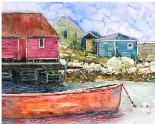
"Low Tide at Peggy's Cover" Third Place Award Kathleen Cropper