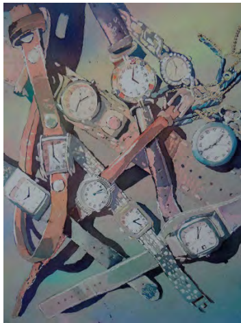
"Time Keepers" Isabel Pizzolato