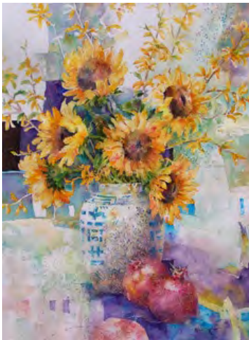
"In Full Bloom"

Curious? View Robin Poteet's work on her website at www.robinpoteet.com .